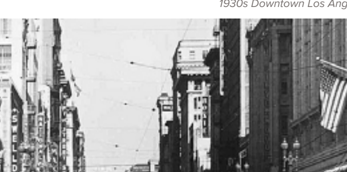
1930s Downtown Los Angeles